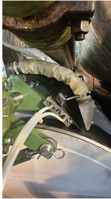
Figure 7: Dust removal system.