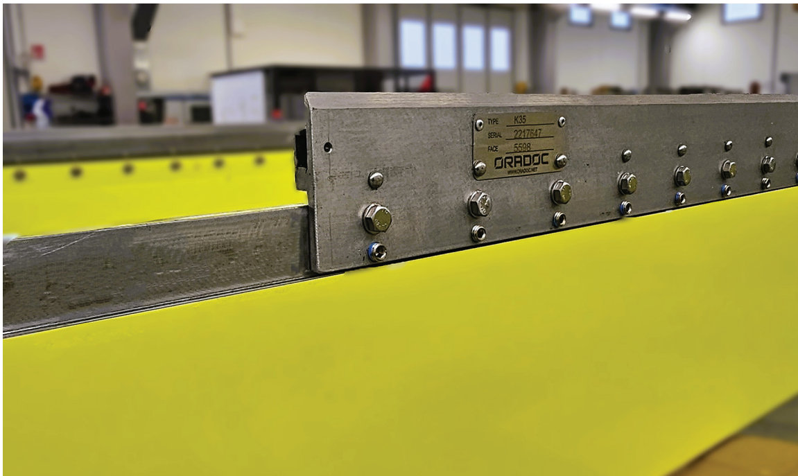
Figure 3: OraClean K35 detail.