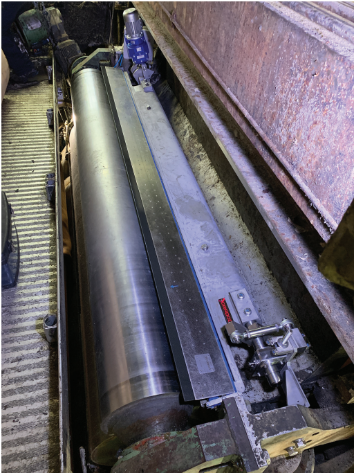
Figure 6: OraFlex press section.