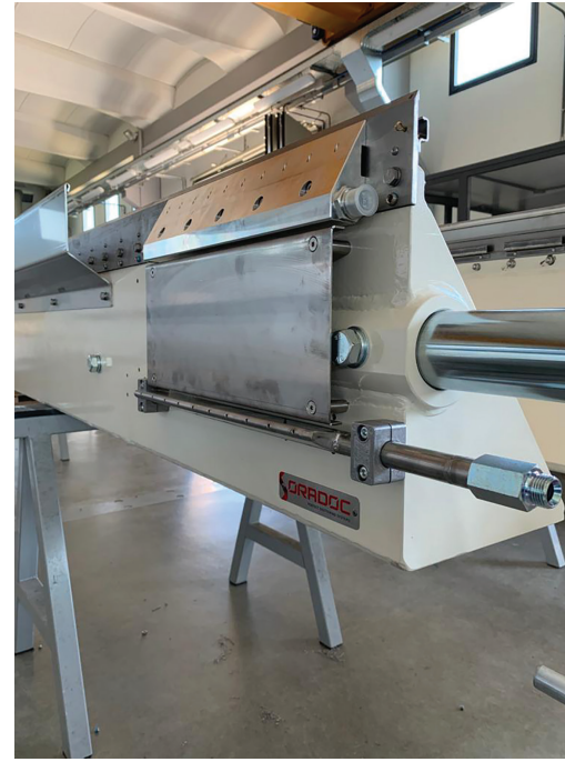
Figure 8: OraThread.

The rigid doctor back, complete with torque arms, maintains the correct working position and safeguards the right stability in case of paper break, while electro-mechanical or pneumatic oscillation helps improve cleaning efficiency on the cylinder and ensures correct operation even at the highest production speeds [6].