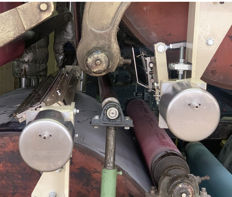
Figure 4: OraFlex drying section (Left).

In this specific part of the drying section, a flexible solution is the most performing, as the OraFlex blade holder features special high-temperature pressure tubes that ensure an even load along the drying cylinder surface during work and it also allows an easier blade replacement during the rest phase [5].