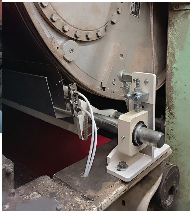
Figure 5: OraFlex drying section (Below).